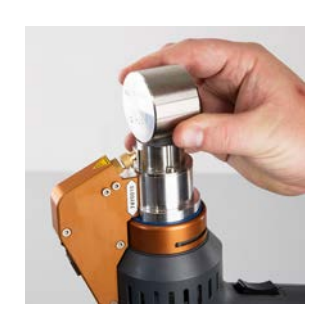
Spark with rubber seal